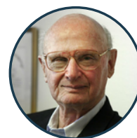
Dr. Harry Markowitz