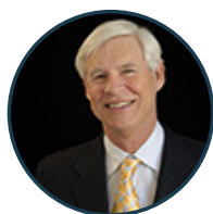
Prof. Robert Engle